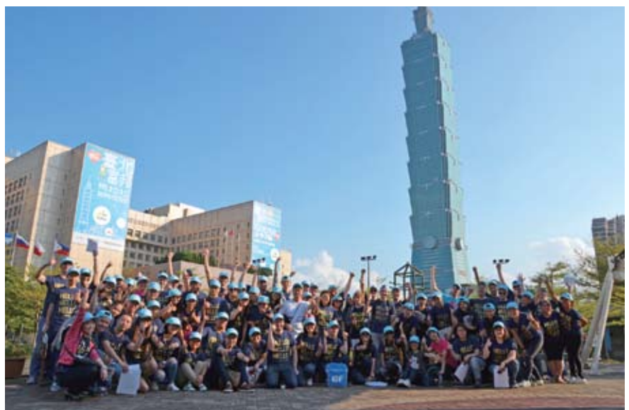
Team-building projects are designed to boost morale and help employees learn to work together more effectively. Here participants in one such program celebrate its completion.