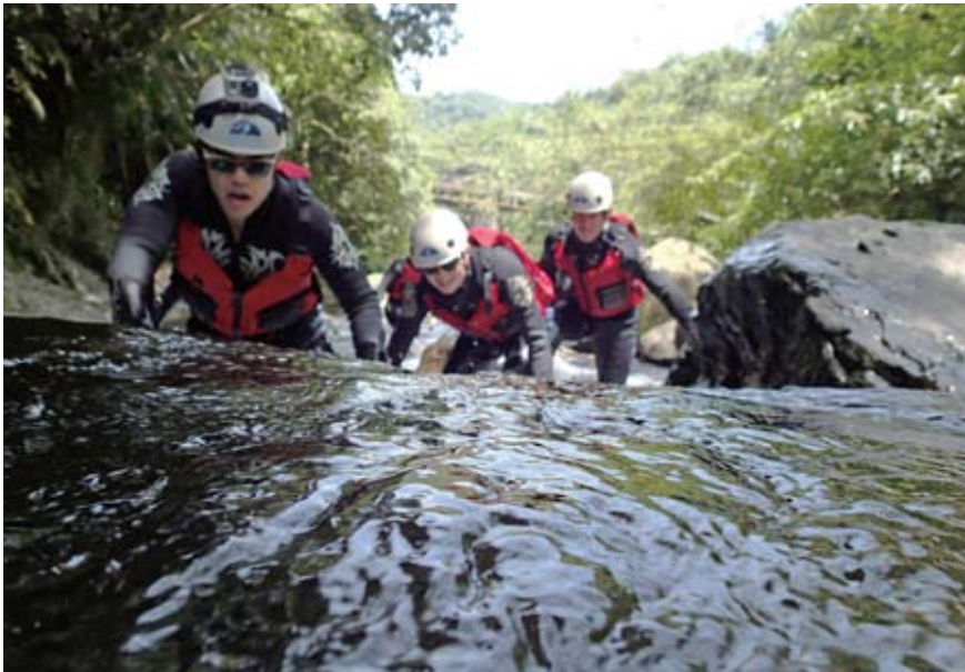
Team building can include an array of challenging, team-oriented activities, including river tracing in the Wulai section of New Taipei City.