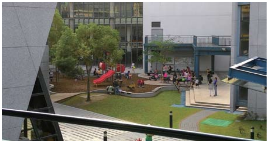
At the Taipei European School's Swire Primary Campus, children from the British, French, and German sections get together for play and sports.

Then there are the foreigners living in Taiwan who have a more ambiguous status. Often working as English teachers or freelance editors or journalists, or increasingly as restaurateurs or other small-business owners, these people lack